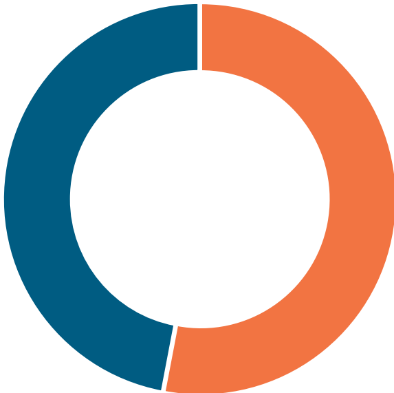
ZCP 2022 Revenue Breakdown

■ Contributions 53% ■ Education Programming 47%